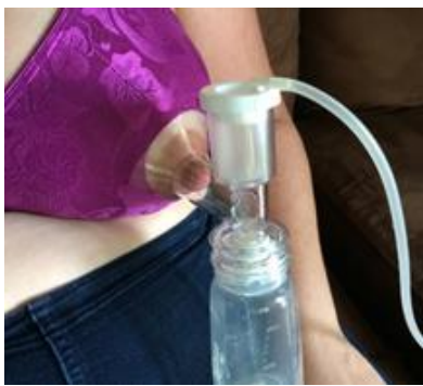
A bra with a cut-out area can hold a funnel while pumping.