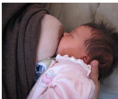
Try a small rolled towel to support your breast.