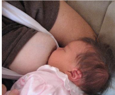
A sling can hold the weight of your breast for the baby.