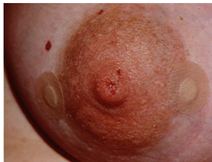
Band-aids® can be used as markers to feel for thumb and finger placement when sandwiching the breast.