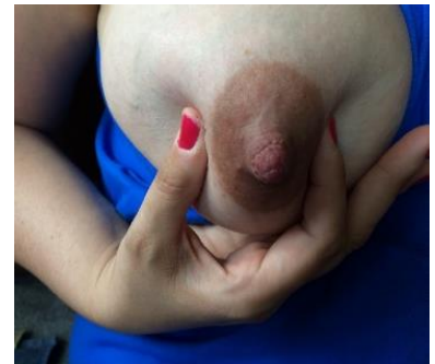
Squeeze 2" (5 cm) behind the base of the nipple to create a "breast sandwich."