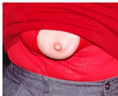
To hide your midriff, cut a hole in a tank top or T-shirt and layer it under your blouse.