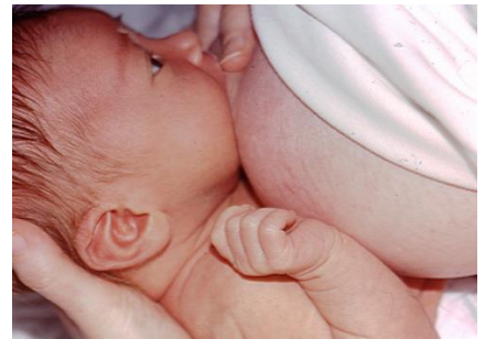
Be sure the weight of your breast is not on your baby's chest. Lift your breast up with your hand.