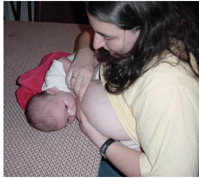
Your hands are free to hold the breast when your baby is resting on a padded table.