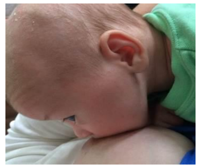
Look for a space between the baby's nose and breast and between the chin and chest.