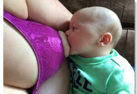
A bra with a cut out area can support the weight of the breast.