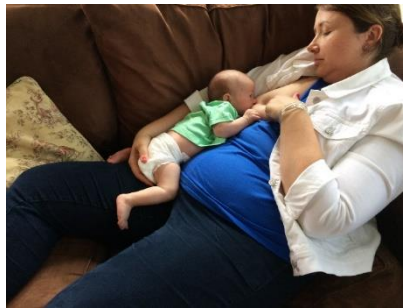
Lying back at an angle works for some women. Find your most comfortable position.