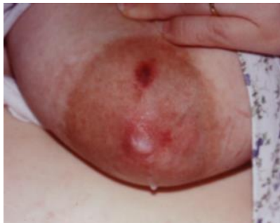
Some women may lack nipple sensitivity, so they do not feel when the baby is incorrectly latched, creating a hiccup.