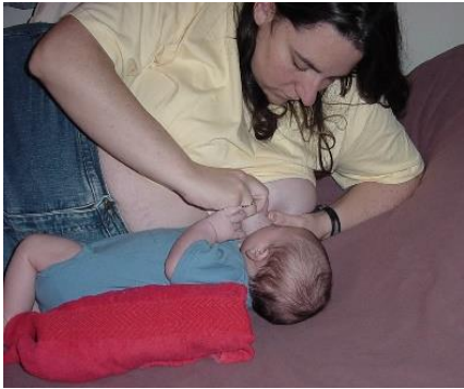
Find positions where your breast and your baby are both supported, such as lying on your side.

Find a position that supports both your breast and your baby so your hands are free to hold the end of your breast into the baby's mouth.