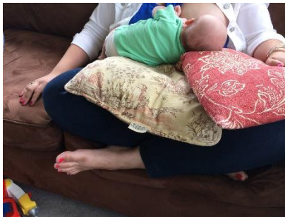
Sitting cross-legged with lots of pillows under the baby is another possible position.