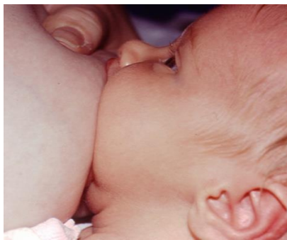
To make an airway, press the breast down and toward the baby's nose. (Do not pull the breast away from the baby.)