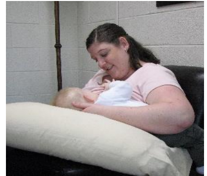
When commercial nursing pillows do not fit, try bed pillows to support your arm.