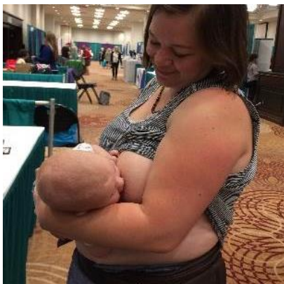
Body exposure can be a big concern when in public.